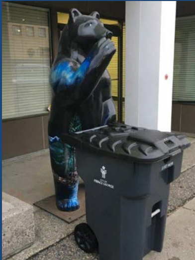
P.G. Bear-Resistant Garbage Cart