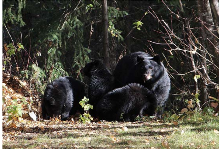
Local black bears in Prince George

YOUR NEW CART WILL BE DELIVERED ON GARBAGE COLLECTION DAY MONDAY, APRIL 15 TH , 2019